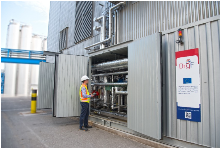
BU: DryFiciency high-temperature heat pumps were commissioned in three applications and tested in an industrial environment. Plant at AGRANA Stärke in Pischelsdorf.