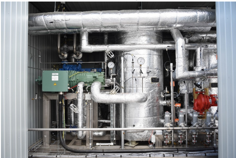
BU: DryFiciency high-temperature heat pumps were commissioned in three applications and tested in an industrial environment. Plant at AGRANA Stärke in Pischelsdorf.