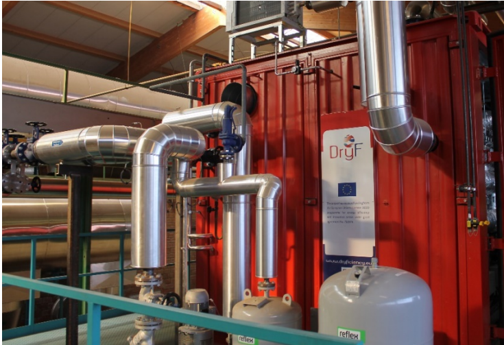
BU: DryFiciency high-temperature heat pumps were commissioned in three applications and tested in an industrial environment. System at Wienerberger AG in Uttendorf